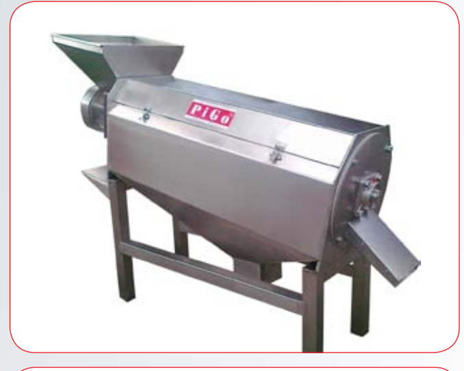
PG 251 Horizontal pulper