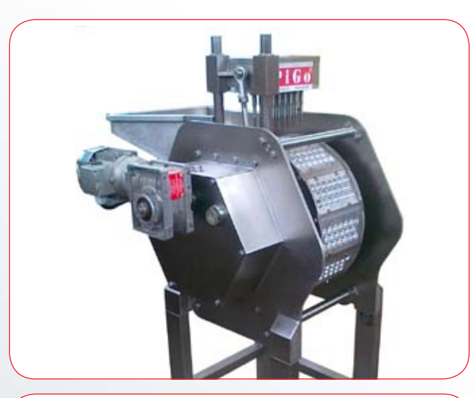
PG 104 Pitting machine