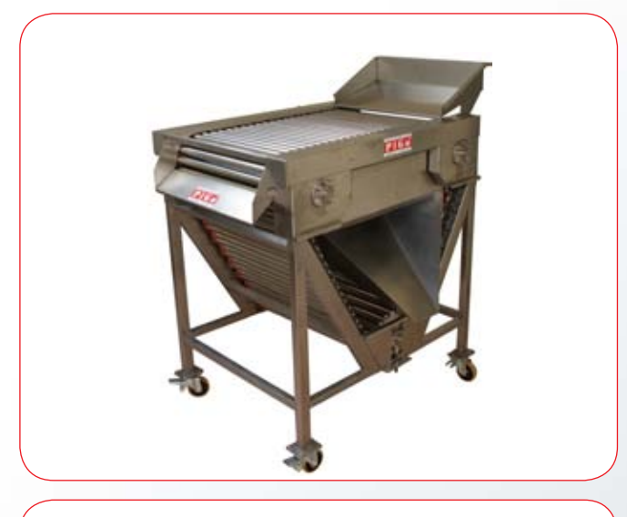
PG 061 Sorter