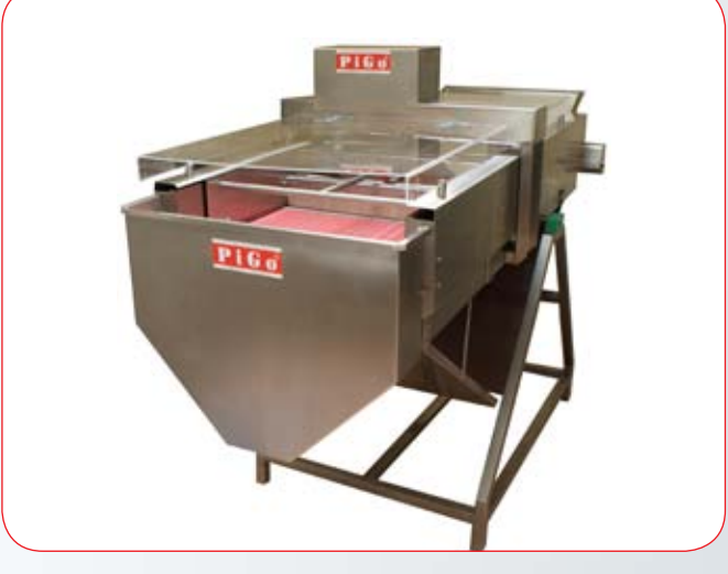
PG 138 Destalking machine