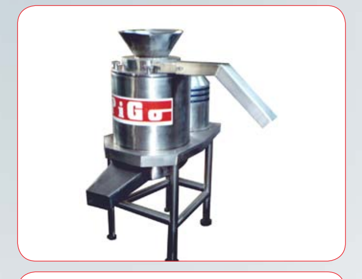
PG 250 Vertical pulper