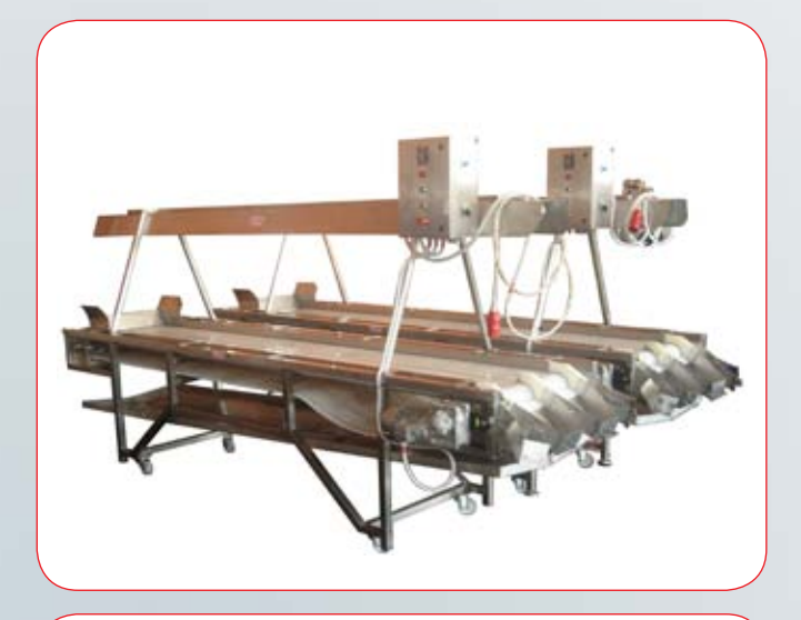
PG 025 i Inspection belt