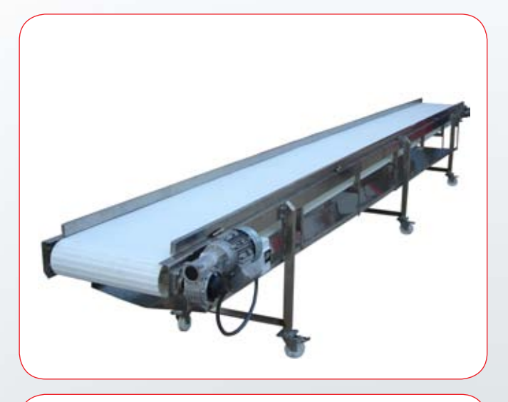
PG 025 Conveyer belt