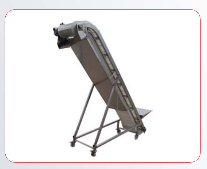
PG 033 Elevator