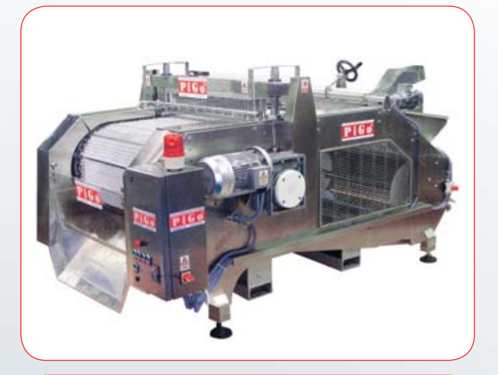
PG 103 Pitting machine