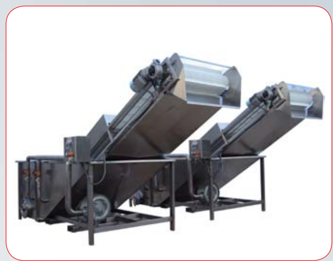
PG 001 Washing machine